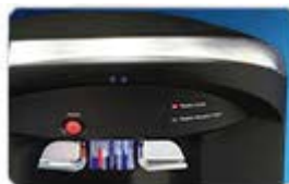
LED Night Light, Low bottle Indicator and replace SmartFlo™ SF-1 Indicator