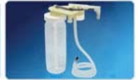
Replaceable Reservoir System - SmartFlo™ SF-1 Water Cartridge