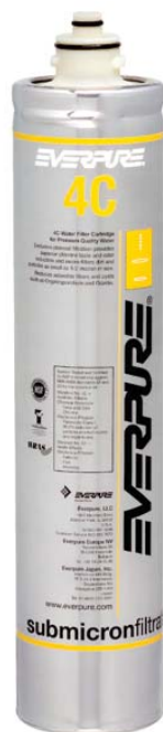
4C Replacement Cartridge: EV9600-00 (1-pack) EV9601-00 (6-pack)

Delivers premium quality water for cold cup vending applications