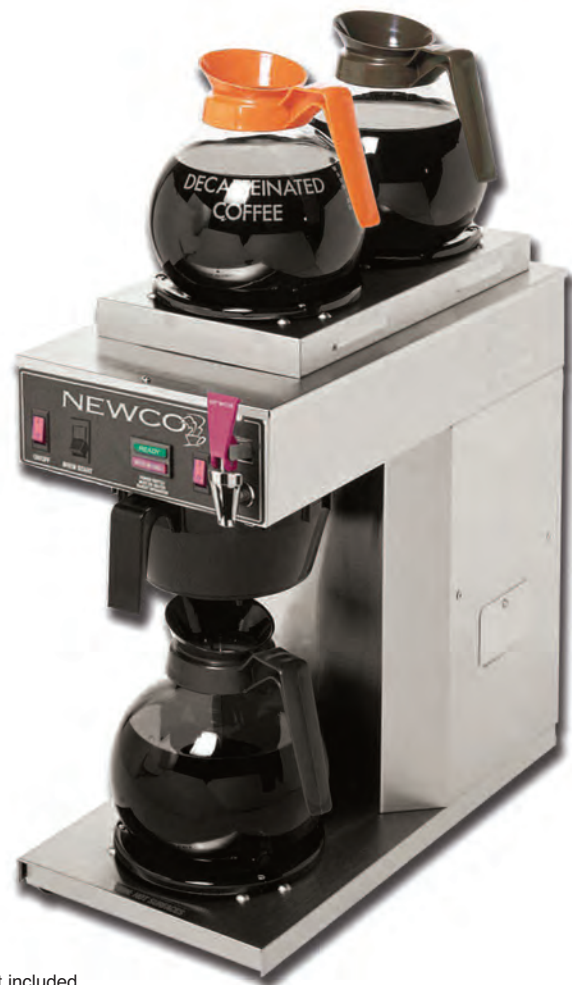
Decanters not included

All the features are built into a stainless steel cabinet for long stability and durability.