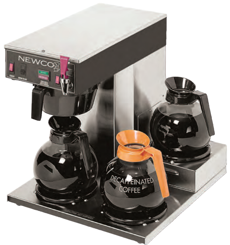
Decanters not included

All the features are built into a stainless steel cabinet for long stability and durability.