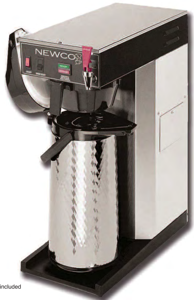
Air Pot not included

All the features are built into a stainless steel cabinet for long stability and durability.